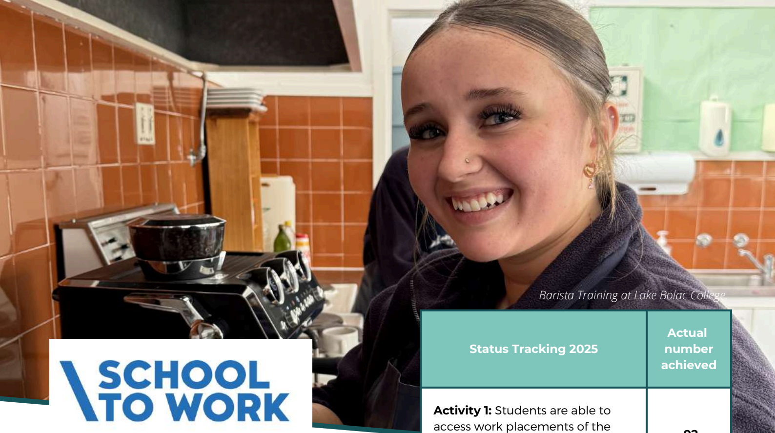
Barista Training at Lake Bolac College