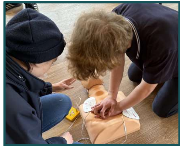
Lake Bolac College students take part in an accredited First Aid/CPR course at their school.