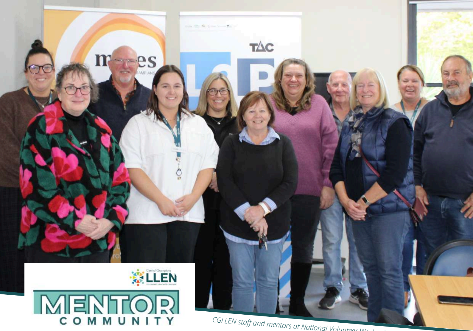
CGLLEN staff and mentors at National Volunteer Week celebrations in Stawell.