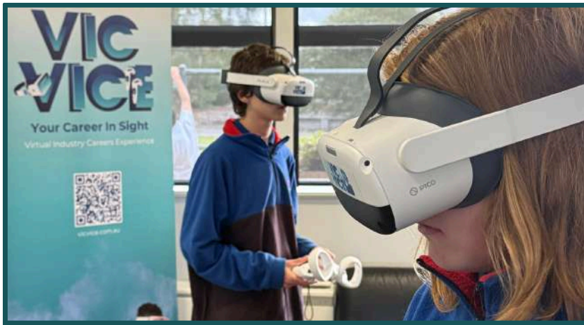
Ararat College was one of four local schools to access VIC VICE through Central Grampians LLEN in 2025.