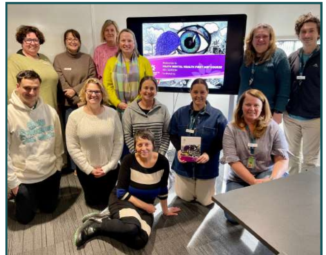
Local teachers and youth workers at our YMHFA training.

The response to the campaign has been overwhelming, with more than 1,000 pay it forward coffees distributed since the initiative was first introduced.