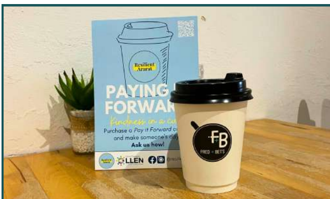
Paying it Forward has been popular with customers at Fred and Bet's and Foragers cafes.

Visit The Positive Postie Virtual Gratitude Wall