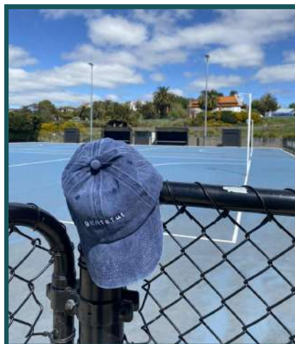
Navy caps were hidden around Ararat during Mental Health Month to promote The Positive Postie Project.