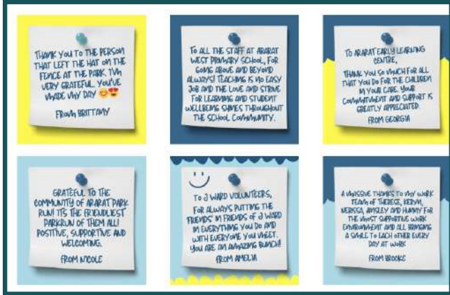
Just some of the messages posted to the virtual gratitude wall.